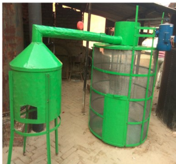
Fig. 1: Photographic view of modified STR dryer

T_1, \dots, T_9 , and M_1, \dots, M_9 , respectively. Moisture content at M_1 and M_2 maintaining 45 and 55 cm from centre of inner bin; M_3, M_4, M_5 maintaining 65, 50, 35; M_6, M_7, M_8 and M_9 maintaining a distance of 65, 50, 35 and 65 cm distance from centre line of inner bin during drying operation. The experimental runs of vertical drying were conducted at initial moisture content of 21.5, 22.5, 23.10 and 24.78 % (w.b) with four air velocities (1.5, 2.0, 2.5 and 3.0 m/s). The moisture content was measured using probe sensor digital moisture meter at a time interval of 10 min during first hour of drying, 30 min for second hour and 60 min for third hour till the end of drying. Drying was terminated when the grains reached at Equilibrium moisture content.